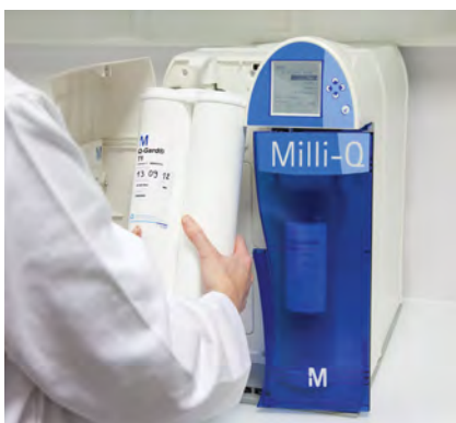
Q-Pak® polishing cartridge replacement