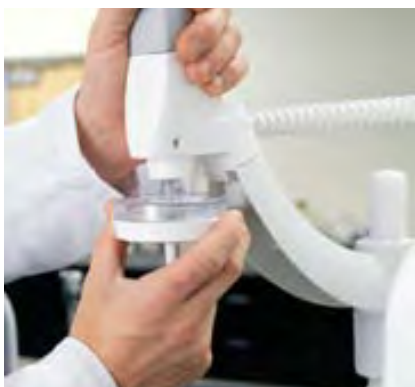
Millipak® Express 40 replacement

The service program portfolio covers all maintenance requirements such as installation, customized user training, scientific and technical support, troubleshooting, preventive maintenance visits, and all validation requirements using ad hoc calibrated equipment, procedures, workbooks and suitability tests within a GXP's environment.