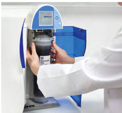
Progard® Pack replacement

Maintenance frequency is minimal, and the procedures are simplified.