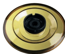
Bio-containment lid (optional) for MICROLITER TUBE PACKAGE - 24, MICROLITER TUBE PACKAGE - 30 & CRYO TUBE PACKAGE