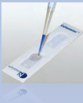
Pipette 20µl of Sample