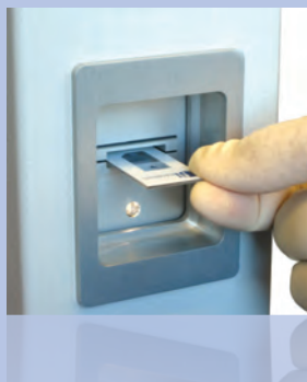
Insert Disposable Slide